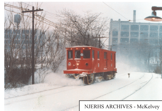
NJERHS ARCHIVES - McKelvey

Views below are a sampling of the utility equipment in our collection.