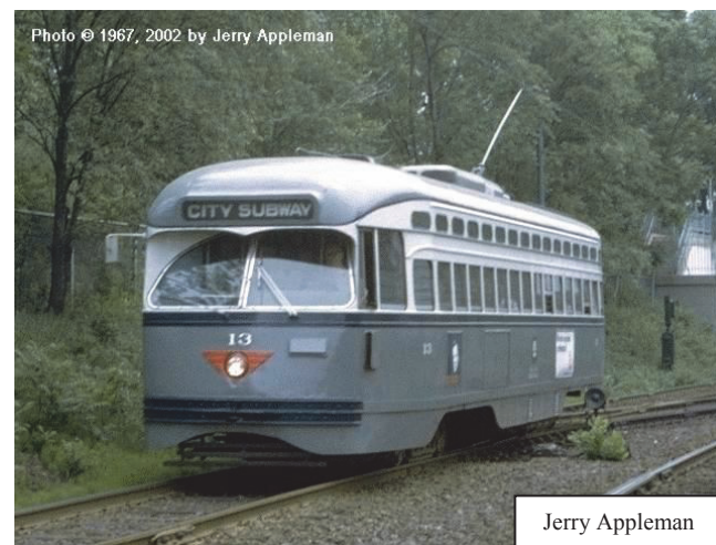
PSCT #13 (ex TCRT PCC #333) is seen operating in 1967 on the Newark City Subway.

PSR 2651, build for WWI service in 1917, was pulled out of storage in 1942 to serve in yet another war. Here, on Bergen Avenue she was hauling more war workers to and from their duty stations.